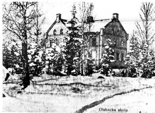
Two schools where Julia worked, The Old School (picture from 1877) and the Olsbacka School (picture from around 1910).